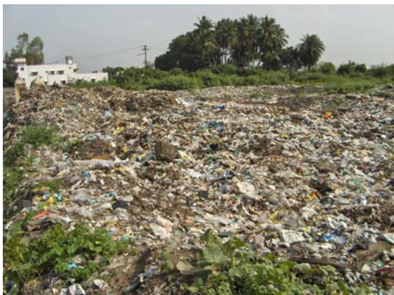
Waste being dumped outside of Kancheepuram town – a very typical sight in India.

Although recent years' fast growth in India has brought about some major positive changes, it is also a severe challenge to the natural environment. Environmental degradation such as contaminated water, sinking groundwater levels, unhealthy soils, and polluted air has become a harsh reality in most parts of India. Noteworthy, a damaged local environment hits the most vulnerable groups of society the hardest as poor and marginalised people lack the resources needed to reduce the negative effects of a degraded environment. One result of a rapid urbanisation, a slowly reducing gap between urban and rural, changing consumption patterns, and a growing population is the problem of waste. The generation of municipal solid waste in India in the year 2047 has been projected to exceed 260 million tons – a number more than five times the present levels.