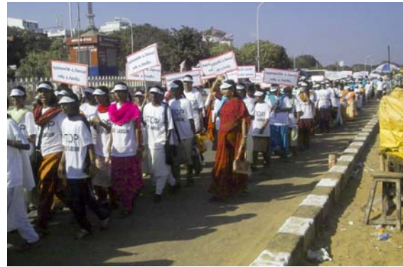
Some of the demonstrators taking part in the Global Walk against Child Labour along the Marina Beach in Chennai.

their enforcement, and build a coalition against child labour.