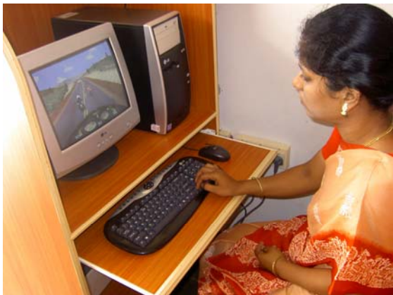
A woman using the computer in one of the Citizens' Centres.

A typical centre has an "IT-kiosk" with one to three computers and facilities for printing/copying/scanning/faxing, as well as a small library with books and dailies to encourage reading habits among children and adults. Some of the centres have Internet but connectivity is generally a problem in remote areas. The centres offer popular computer courses that aim at making the younger generation computer literate, tuition for schoolchildren, public debates and get-togethers, and services to SHGs.